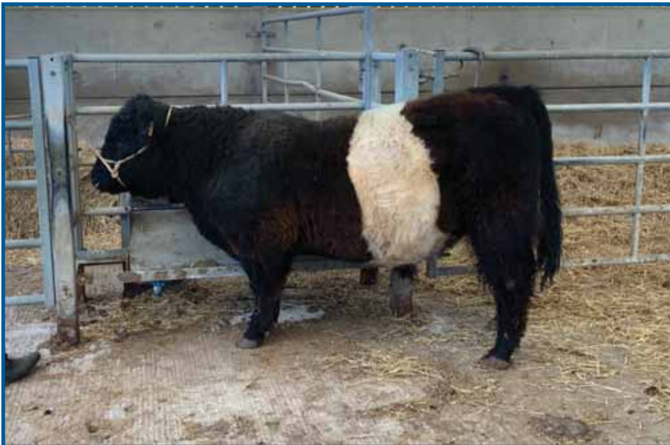
Howe Mill Double Decker (Lot No 24)