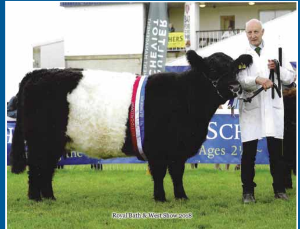
Howe Mill Mustang Sally (Lot No 7) Yorkshire Show Breed Champion 2018 & 2019