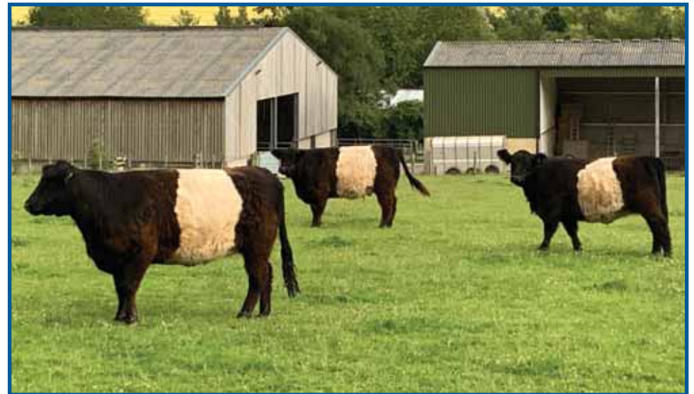
Howe Mill Heifers