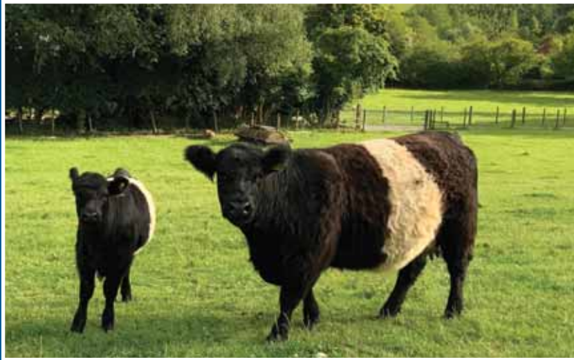
Howe Mill Water Lilly and her Heifer Calf (Lot No 10) Three Counties Champion – Bath & West Reserve Champion