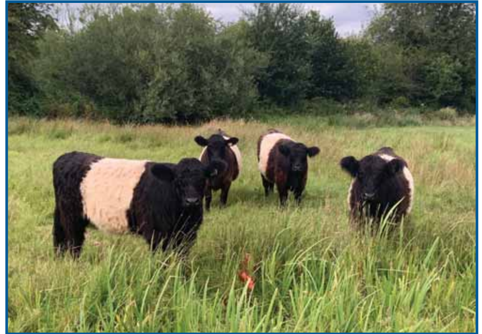
Howe Mill Junior Heifers