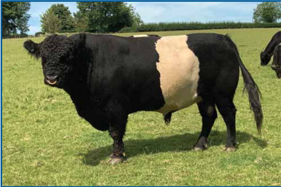
Lomond Auchentoshan (Lot No 22)