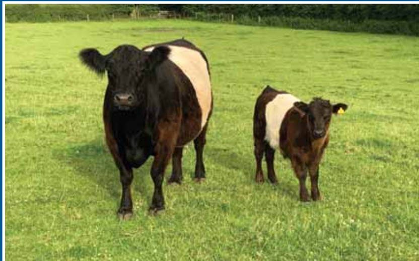
Howe Mill Bossy Boots & her Bull Calf (Lot No 8) Bath & West and Three Counties Champion